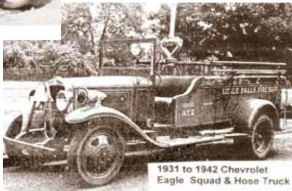
1931 to 1942 Chevrolet Eagle Squad & Hose Truck

In 1942 the squad purchased a 1926 Cadillac ambulance. The