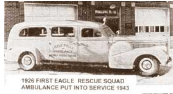
1926 FIRST EAGLE RESCUE SQUAD AMBULANCE PUT INTO SERVICE 1943

new Chevrolet Open Salvage and Hose truck was purchased for the Eagle Hose Company. This truck was used for fire rescue and salvage. Thus the Eagle Hose Company became known as the Eagle Rescue Squad .